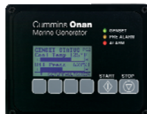
Cummins Onan Digital Display