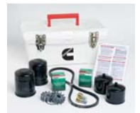
Cummins Onan Cruise Kit