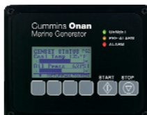
Cummins Onan Digital Display